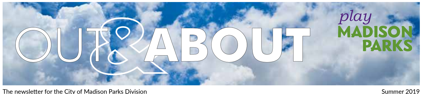
The newsletter for the City of Madison Parks Division