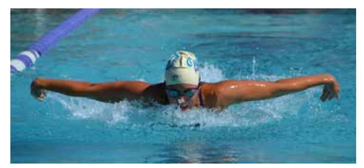
cont. from page 1.

The Goodman Waves is a fun and competitive swim and dive team, training 5 times per week with weekly meets typically on Saturday mornings. Their hard work culminates at the end of the season in the All-City Swim Meet.